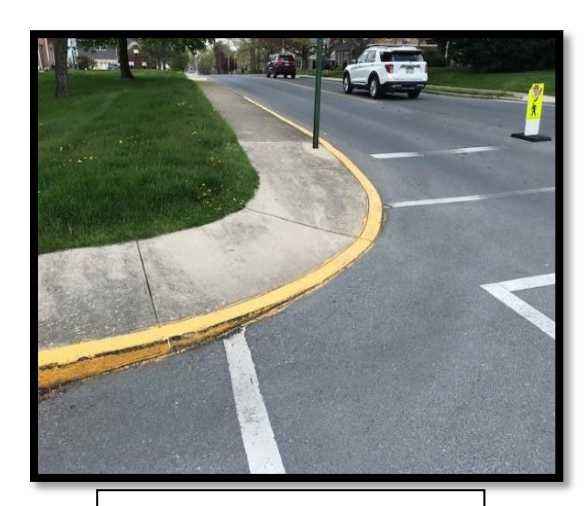
Addison & S. Ridge N. Corner