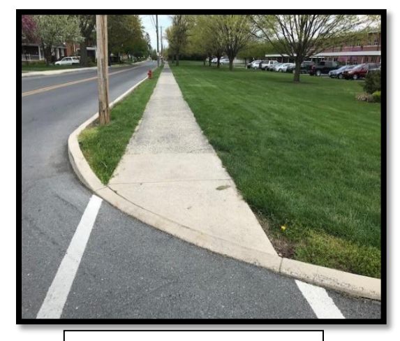
High School South Entrance