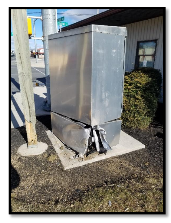
External Damage to Control Panel